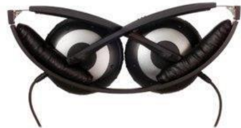
Folded / Transformed Shot (if applicable)