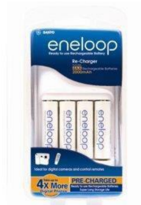
Product Packaging Shot