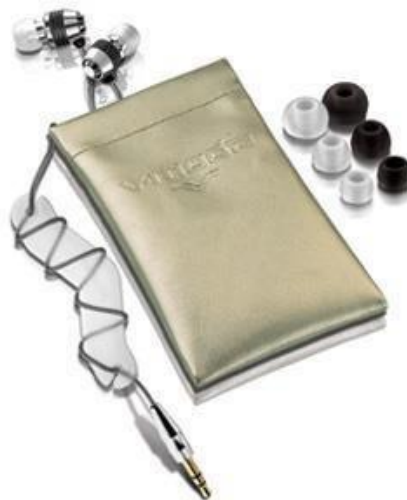
Out of Box Accessories Shot