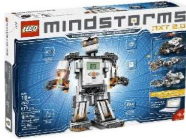
ZOOM See larger image and other views (with zoom)