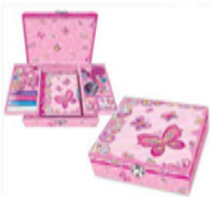
Share your own customer images

Girls Boutique CREATE YOUR OWN SECRET DIARY Set - with Jeweled Box, Pens, stickers, pens, glitters etc *BEST SELLER