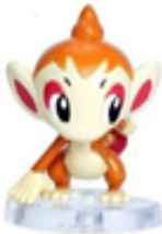
See larger image Share your own customer images

Pokemon 2" Figure Monster Collection –Chimchar **Free Domestic Standard Shipping for This Item!***