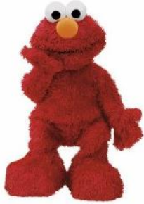
ZOOM See larger image and other views (with zoom)