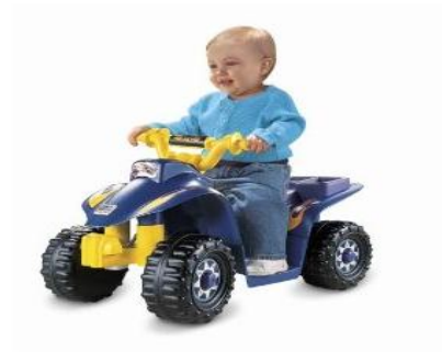
ZOOM See larger image and other views (with zoom)